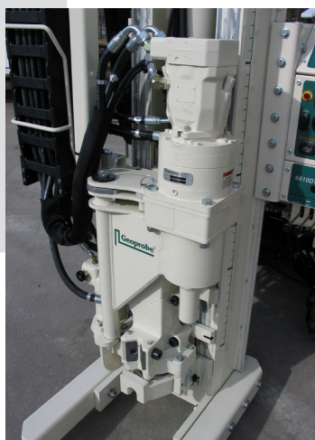
Geoprobe® GH62 Percussion Hammer & GA3000 Auger Head