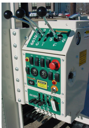
6610DT Control Panel